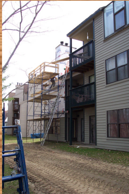
Buildings O and P are receiving new roofs, chimney chases, garden windows, sky lights and re-shingling this summer.