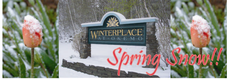
Winterplace was surprised with a snow storm just before May.