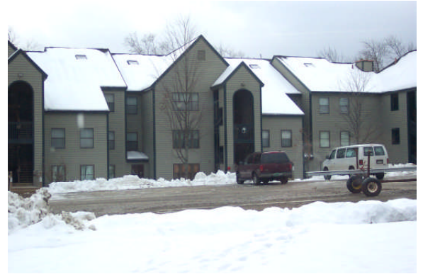
New paint on 'J' building

Exterior paint & trim continues to be updated. Buildings H, J & K were given a facelift over the summer. Updated exterior painting includes green trim along building edges.