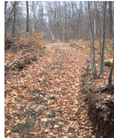
Ski trail access to "T", 'P' moved 10' above old trail entrance. The new entrance is a smoother, more gradual access point.