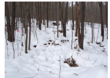
Above left: View from the new 'X' building ski trail Right: Looking up 'X' trail